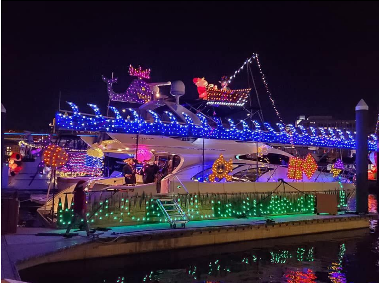
Hi-Jinx III in sparkling splendor ready for her run down the Potomac.