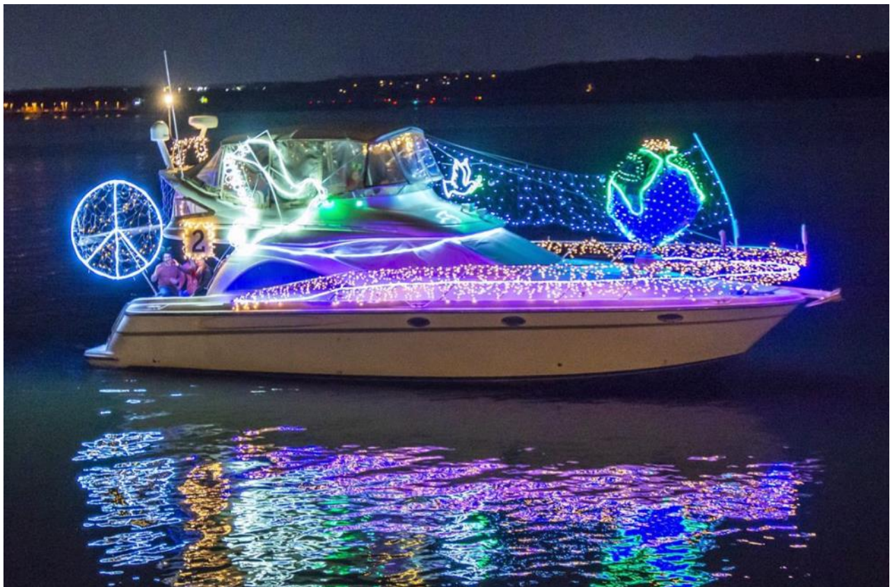
The Anamchara decked out for the Parade of Lights. Winner of the Founder's Trophy in DC and Best of Show in Alexandria.