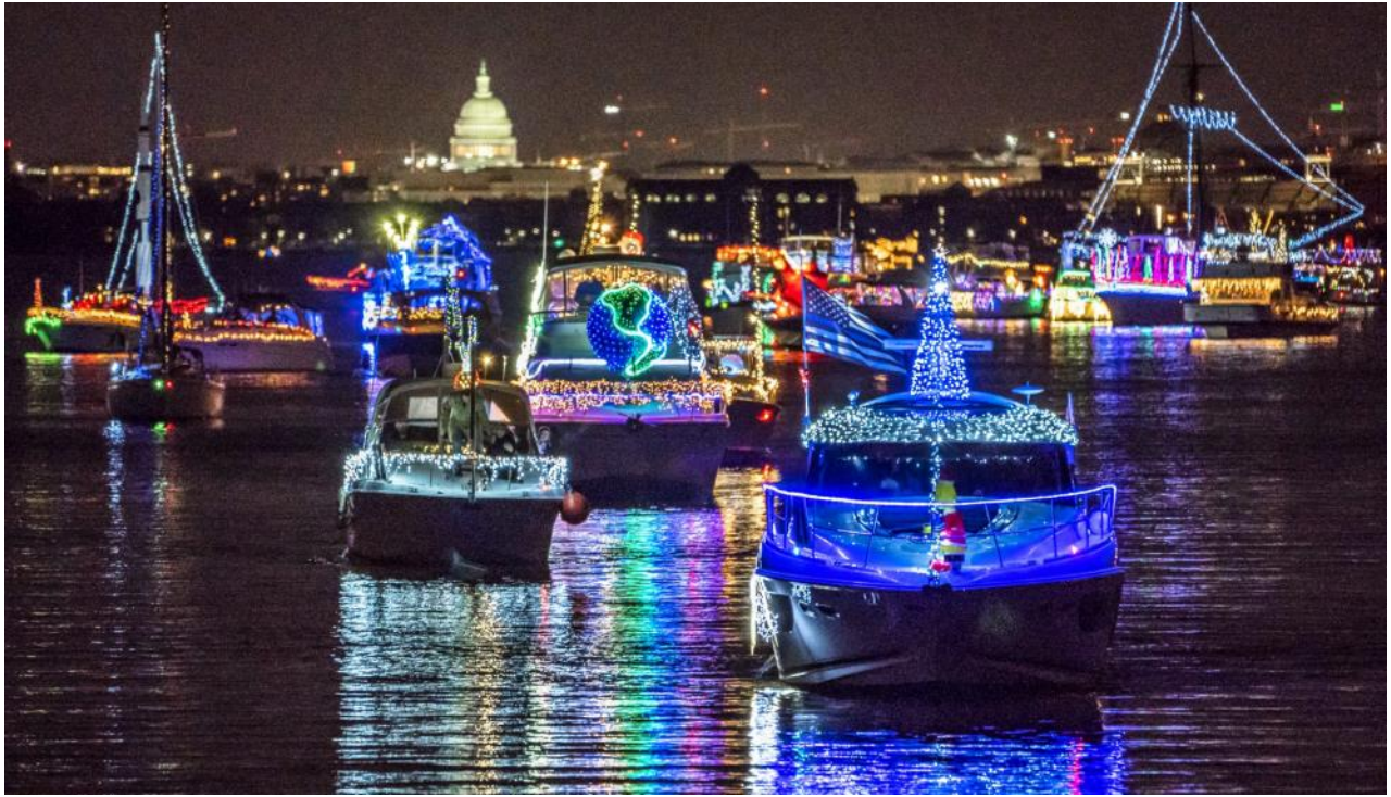
The start of the 2019 Parade of Lights.