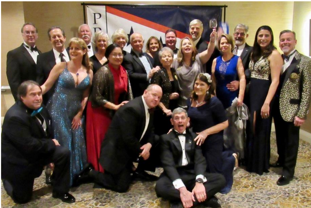
PRYCA Change of Watch