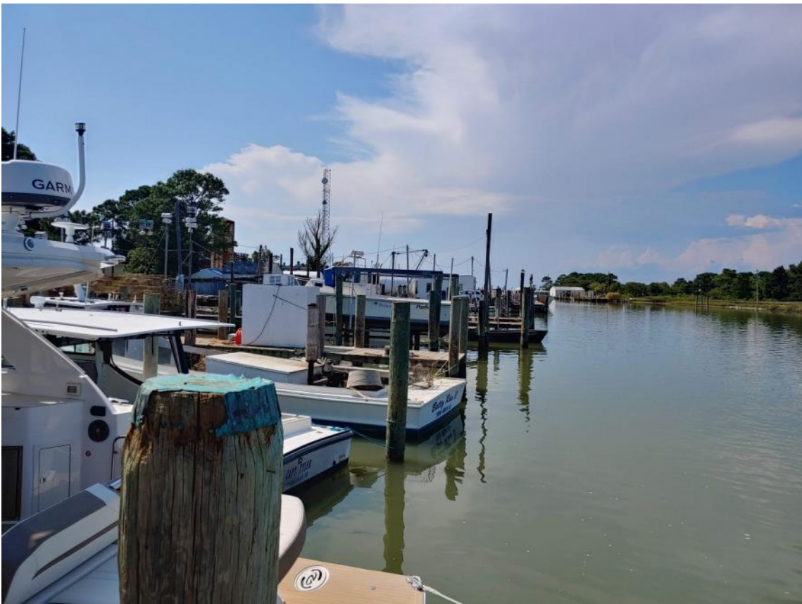
Smith Island—Chesapeake Bay

https://advocacy.boatus.com/boatusv2/app/onestep-write-a-letter?2&engagementId=505939