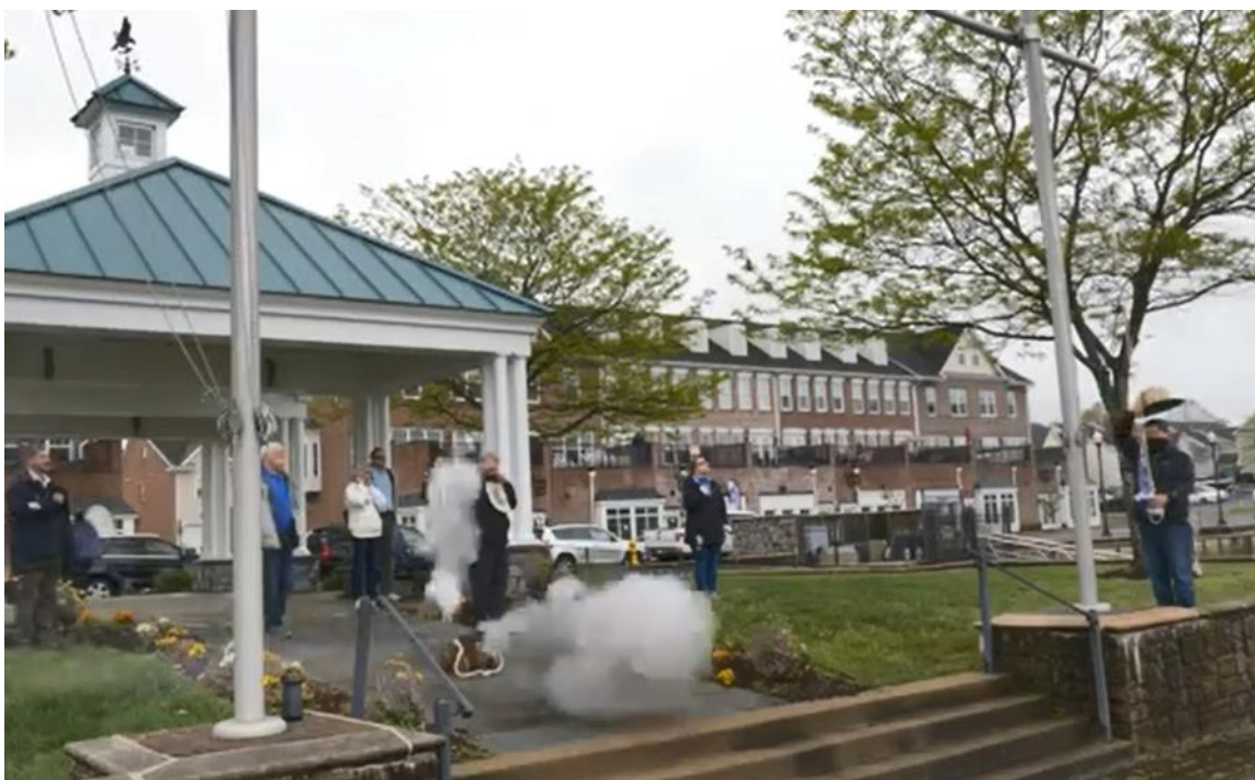
OYC 2020 Flag Raising - Belmont Bay Marina