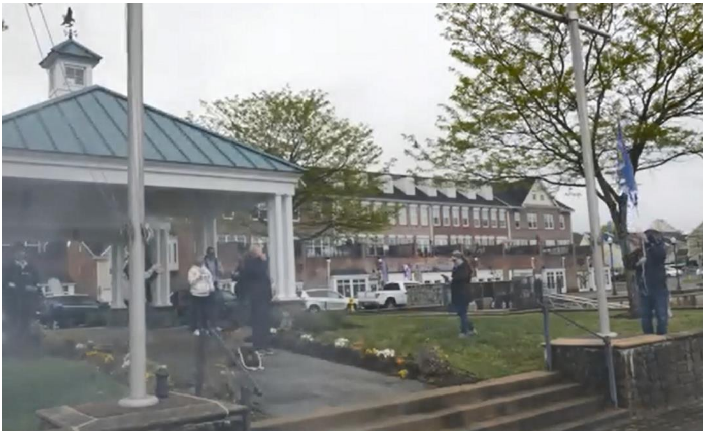
OYC 2020 Flag Raising - Belmont Bay Marina