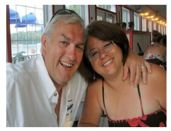
Al Stewart Nite Breeze

On another subject, I did notice, via Boat US, that there have been some tax changes in the works for boaters. Here is the link to the story - https://www.boatus.com/magazine/2019/april/tax-changes-for-boaters.aspx.