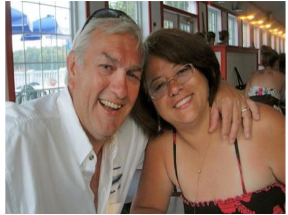
Al Stewart Nite Breeze

Photos should be no larger than 5"x7" and you may enter one photo in each category. All photos should have a boating theme. Please put your name, category and other pertinent info on the back. place photos in each of the four categories. Can't wait so see everyone's pictures!