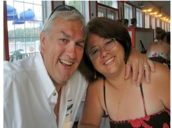
Al Stewart Nite Breeze

"A Vessel Safety Check is an inspection of your boat performed with you and a volunteer member of the Coast Guard Auxiliary. The primary goal of a safety inspection is to discuss with you required safety equipment and safety features specific to your boat. Results of the Safety Check are not reported to anyone. A boat either passes or fails. If your boat passes the Safety Check, a Decal is affixed, indicating all required equipment is aboard and functioning properly. This decal is also known as "The Seal of Safety" and your boat is recognized by law enforcement agencies as being equipped with the required safety items.