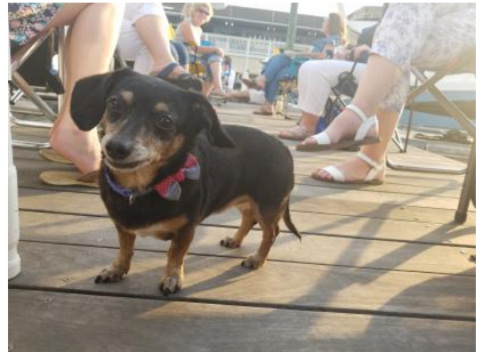
Happy Hour (cannon test)