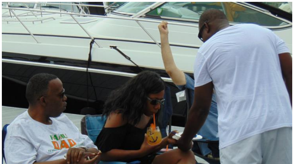
Colonial Beach 2018 (continued)