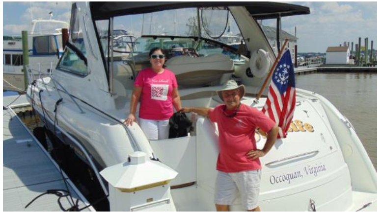
Colonial Beach 2018 (continued)