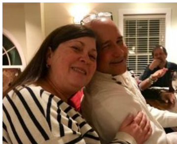
January OYC Whiskey and Wine Tasting!

There is no off season when you're a member of