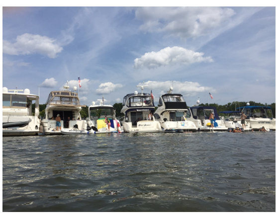
OYC 8 Boat Raft Up at Mattawoman Creek, August 27, 2017

Two gallons per mile, three BOAT dollars, over nighting on the hook, running my gen, rafting up, gunkholing at Mattawoman Creek, low tide rising, docktails at Belmont Bay!