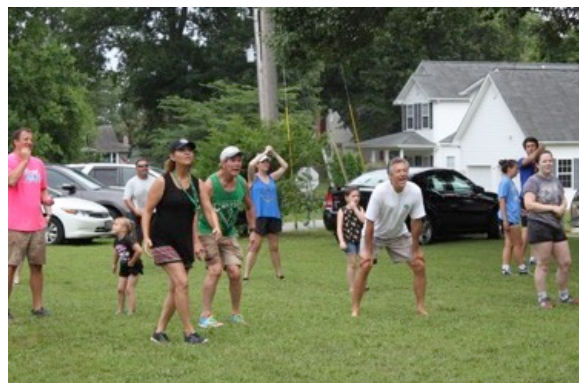
and catching of the shot (sling shot water balloons),