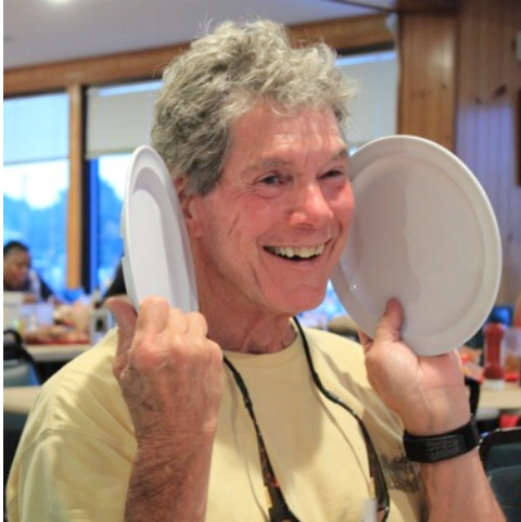
What happens on Cobb Island stays on Cobb Island!"