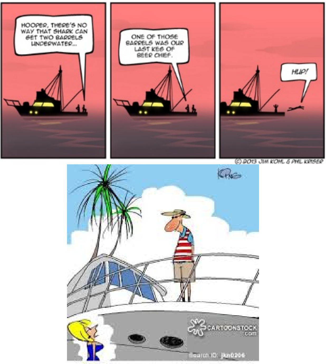
"What do you mean you were having such a good time on your boating trip you lost track of time? You were supposed to be home over a year ago!"