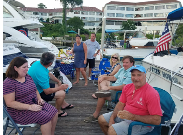
Docktails at the Tides Inn Marina