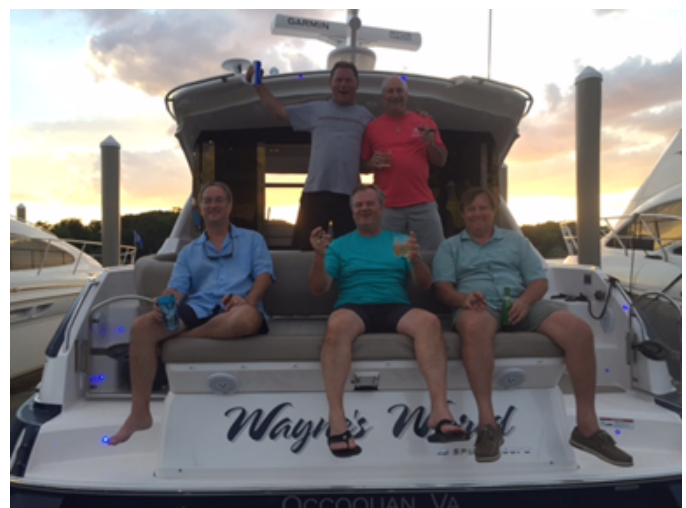
The Captains just hanging out on Wayne's World.