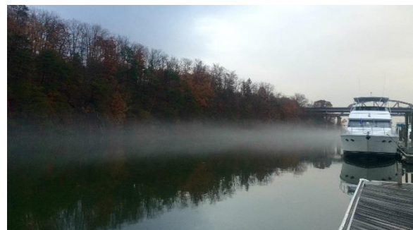
1st place Just boats

Here are some of the photos that won during our OYC photo contest.