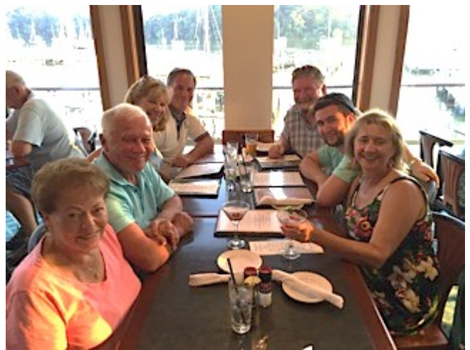
Dinner at The Granary in the Sassafras River

Sassafras Harbor Marina, one of several large marinas on the Sassafras, has 200+ slips, both open and covered, as well as a 70-ton travel lift, a full service department, and friendly, capable staff. It offers many amenities, including an activity center next to the pool and a well-stocked marine store and gift shop. Although the café on the grounds has closed, The Granary Restaurant is just a short walk down the lane; and it is well worth the walk. Dinner there the first night was so impressive, we went back a second night!