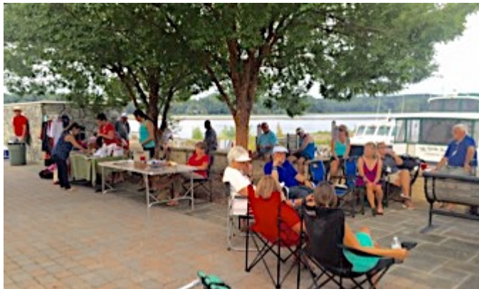
EAT, DRINK, RELAX at Shrimpfest! (See more pics at the end of this newsletter!)