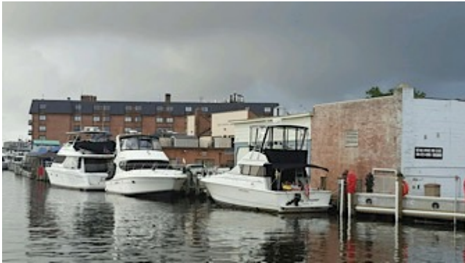
Threatening skies at Annapolis, Chandler Dock on Ego Alley

south and turning back to the western Chesapeake shore for two nights at Annapolis City Dock. We had reservations at Chandler Dock in Ego Alley, previously known as the wall in front of Fawcett Marine Store, which no longer occupies that building. The slips on the opposite side of Ego Alley are on a first-come, first serve basis; so we opted to pay the slightly higher docking fee to guarantee a berth in the heart of Historic Annapolis.