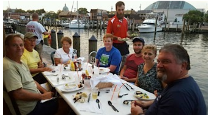
Dinner at Pussers on Ego Alley in Annapolis