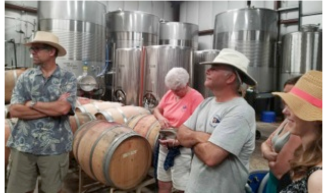
At Ingleside Plantation Winery... learning how they make that stuff we enjoy so much