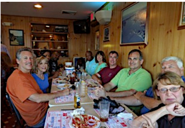
Seafood Dinner at Captain John's