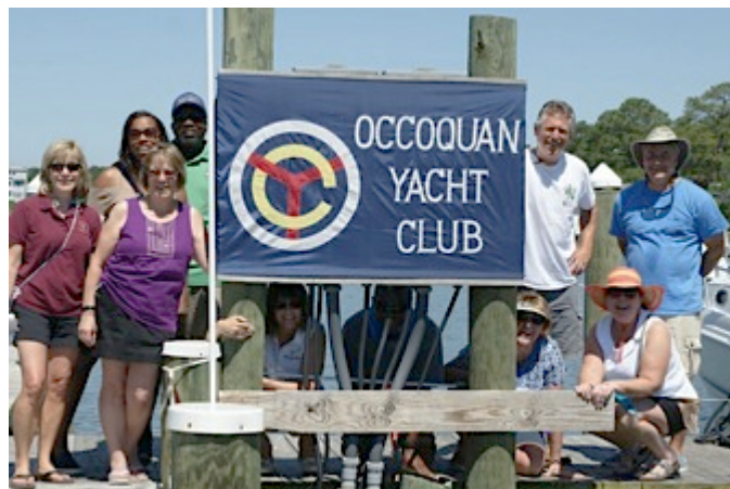
(More pictures at the end of this newsletter.)