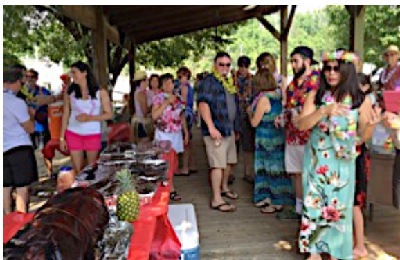
An OYC Hawaiian Luau