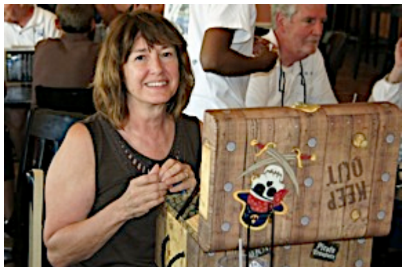
Thanks, Cobb Island Yacht Club!