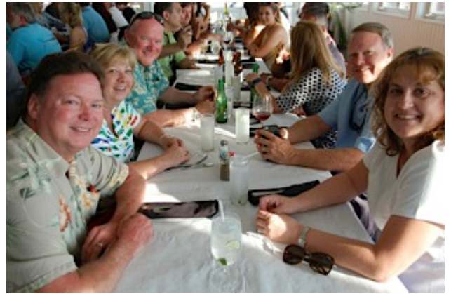
OYC at the Lighthouse