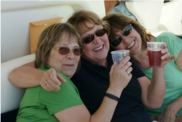
Yo-ho-ho and a boatfull of friends.