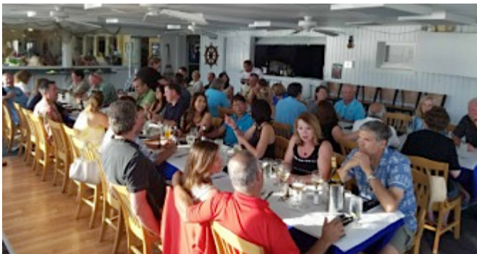
Dinner at the Lighthouse