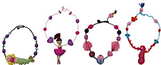
Pictured: Mermaid and Ballerina (blonde and brunette available), Cupcake & Seahorse

Last, for the little girl in your life, how about one of these beautiful handmade necklaces, only $28 .