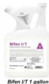
Bifen I/T 1 gallon

has gone by several names over the years such as Talstat P, Talstar Pro, Talstar One, or just plain Talstar. While the name has changed, the product is still the same reliable product. It contains the active ingredient Bifenthrin 7.9%. Bill reports you can mix some in a spray bottle and spray the whole boat inside and out. The inside spraying last about 3 months and the spraying of the boat its self can last about a month. This product is what Bills environmentally safe exterminator uses. (Green Pest).