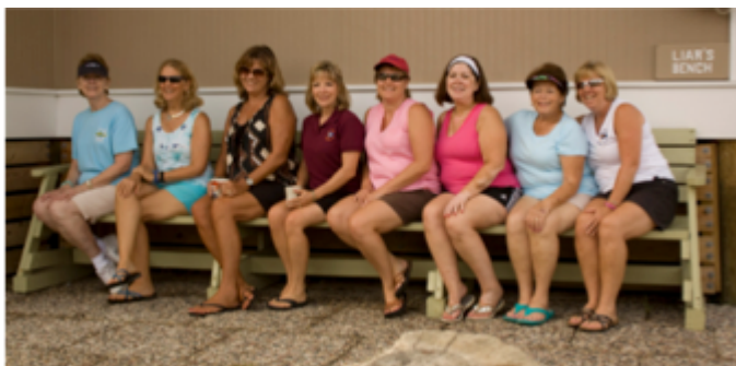
The sign ("liar's bench") says it all!!

Just a short walk across the parking lot, the restaurant Mallards at the Wharf has the best mussels on the Bay, and that's not just my opinion. Many in our group enjoyed them so much on Sunday night that they ordered them again on Monday night! On the second night there, some in our group also discovered Bizottos for another fine dining experience. And Janet's Café, just a few blocks from the wharf, is a real treat for breakfast or lunch, with small town atmosphere, great hospitality and service; and yes, the food is good too. Fortunately or unfortunately, depending upon one's point of view, we visited Onancock on days when very few of the specialty shops were open, thereby saving loads of cash! Window shopping is always the economical option!