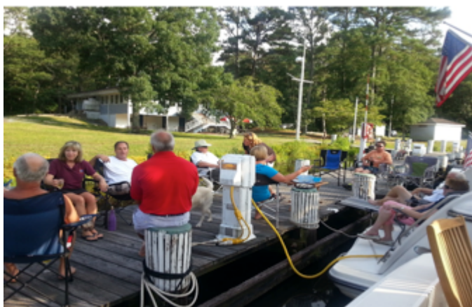
Nightly Briefing Session

We stayed at Shad for three nights, but it is such a serene setting, we could have stayed longer. I consider Shad Landing on the Pocomoke River the best cruise destination on the Bay.