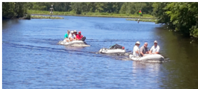
It's a Golfers' Convoy! The clubs are riding in the middle dinghy

Did someone mention golf? The Nassawango golf course is about 2.5 miles downriver from Shad Landing. Our desire to play golf there presented a bit of a transportation dilemma, since we didn't have a car and the tiny dock at Nassawango was too small for even the smallest of our boats. The picture below tells the story of how we solved the problem – three guys in one dinghy, towing another dinghy with the golf clubs, and four guys in the last dinghy! Green fees were only $25 with a cart, and virtually no one on the course except us... which turned out to be a good thing, or people would have been hurt by errant tee shots!