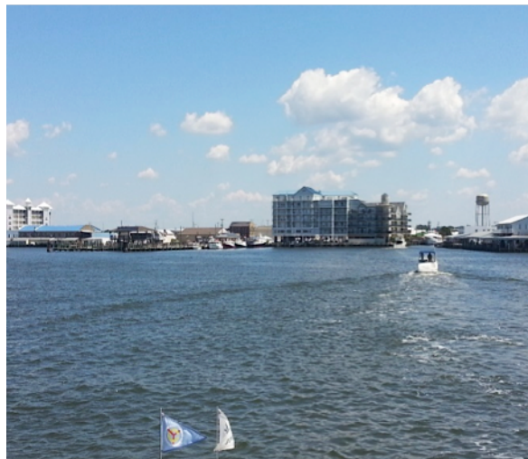
Entering Crisfield, with Oasis in the lead

while Bay Dreamer , Oasis , Anamchara , and Takin' It Easy moved on to the Wicomico River and Salisbury.