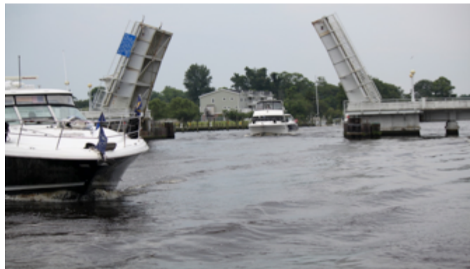
Hi-Jinx, Takin' It Easy, and Dig Life passing through the raised bascule bridge at Pocomoke City

boaters hail the bridge tender, as we did, to allow our parade of boats to pass through the raised sections of the bascule bridge.