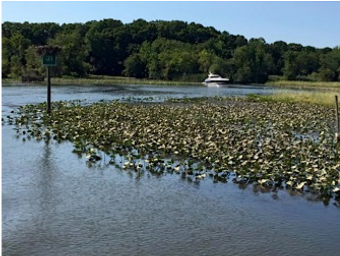
Wayne's World threading the needle

Due to work getting in the way and tidal concerns, seven of OYC boats and crews (approximately 15 2-legged and 8 four-legged) arrived.