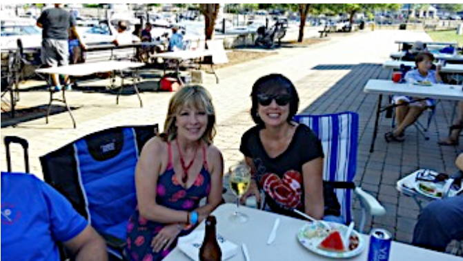
"The Debs", who just happen to be with "The Dans"