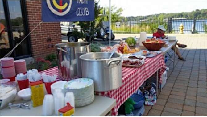
The amazing Shrimpfest spread and Grillmaster, Jim Poulos, taking a well-deserved minute to enjoy some food.