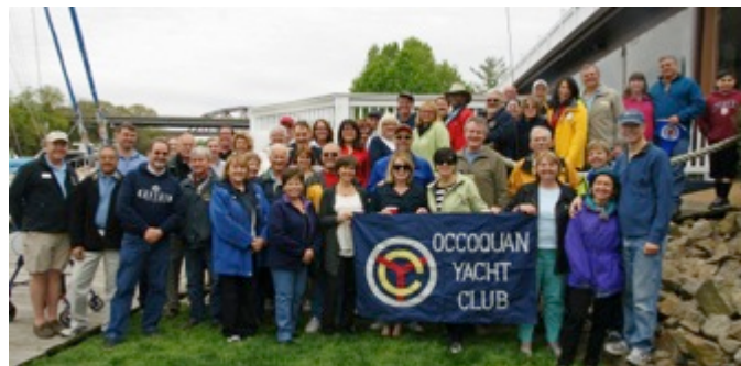
IT SEEMS LIKE ONLY YESTERDAY... 2015 FLAG RAISING