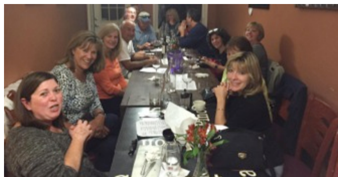
Recent impromptu gathering at the Bottle Stop in Occoquan.