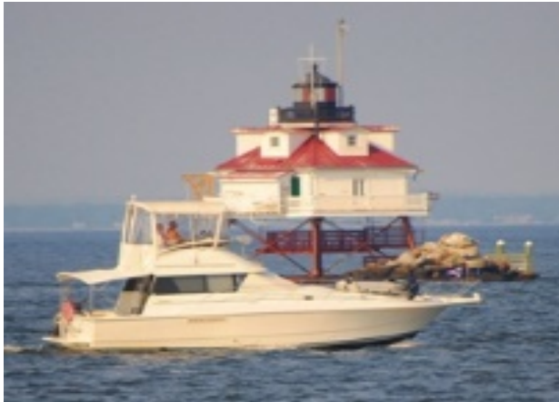
Thomas Point Light