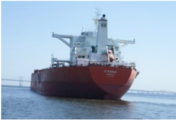
Newest OYC Member