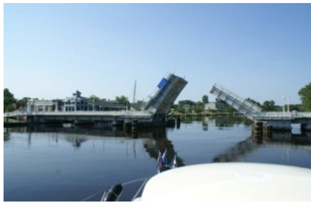
Bascule Bridge On the Pocomoke River Opens for OYC!