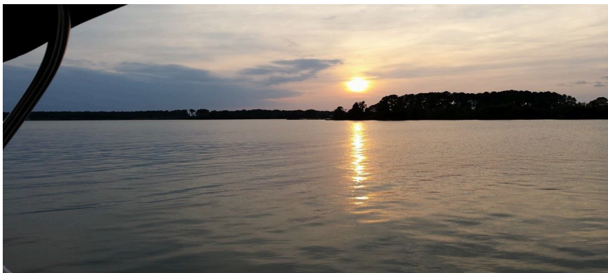
Sunset over Smith Creek, from the dock at Point Lookout Marina, Float-In 2014