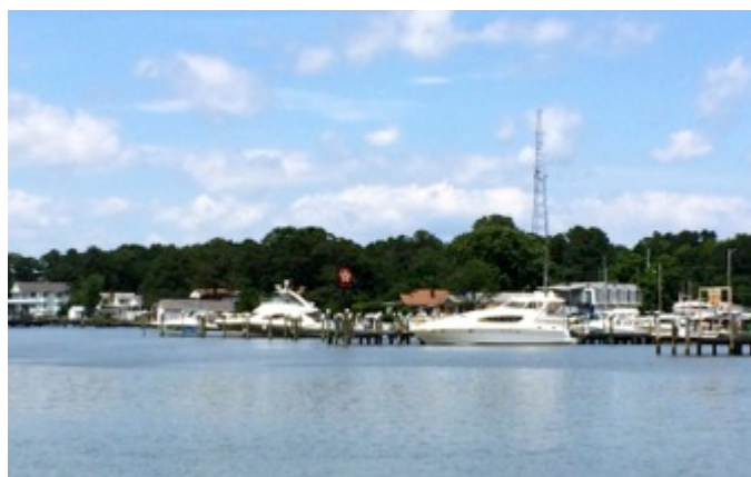
Last two OYC boats on the dock, Lady Min and Lala's Par'Dice

The Daymarker is published monthly by the