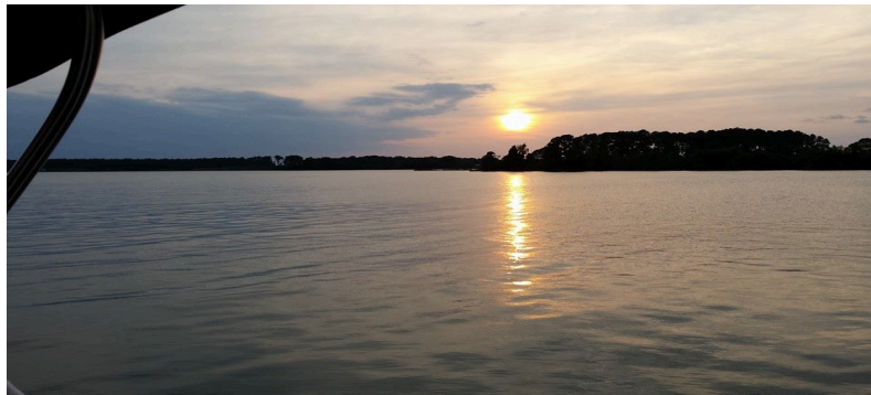
Sunset over Smith Creek, from the dock at Point Lookout Marina, Float-In 2014