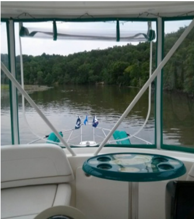
View from Makia III headed up the Aquia