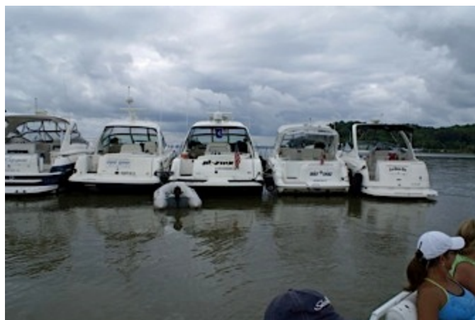
On the shuttle headed to gather...coconuts? No, rum punches!