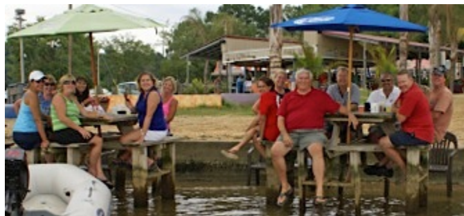
Crew of the... SS Minnow?