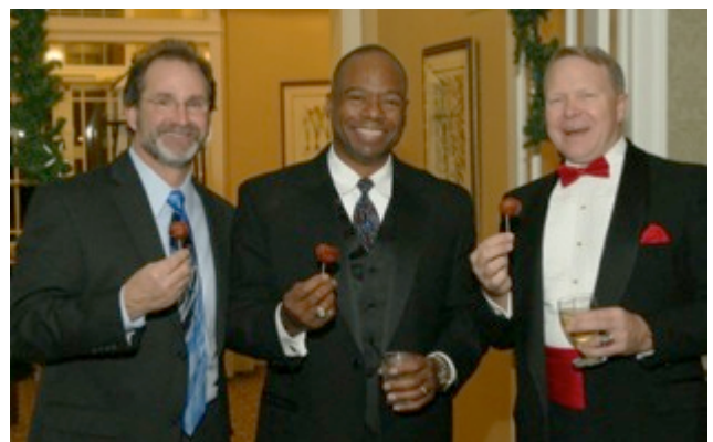
Meatballs... need I say more?