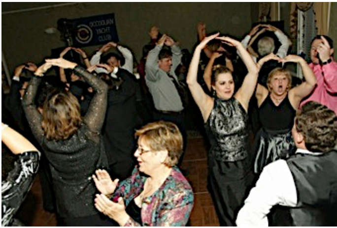
O-O-O-O-O Y C A !!!!