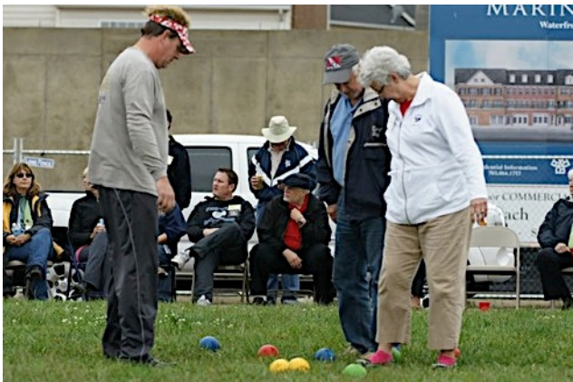
The Great Bocce Ball Debate