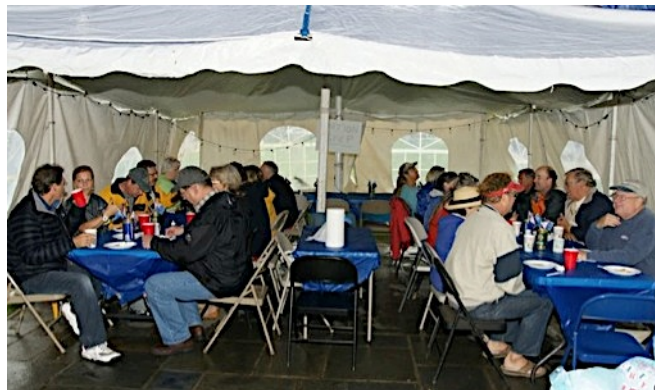
Dinner under the tent

the town of Occoquan for shopping, dining, and pub crawling. Saturday night's Awesome Aussie Barbie capped off a tremendous day. Everybody arrived at the outback pavilion in time for barbecue provided by Dixie Bones and shrimp on the barbie grilled up by OYC volunteers. Special thanks to all those OYC volunteers who prepped the shrimp to complete the Aussie-ness of the Awesome Barbie!