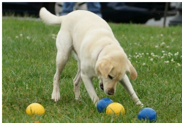
Biscuit playing bocce ball