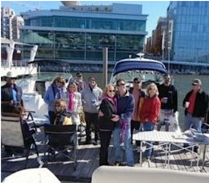
OYC on the dock at National Harbor