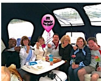
Day Cruise to Solomon's Island that became

just that. But it showed how determined we were to cruise in 2013!