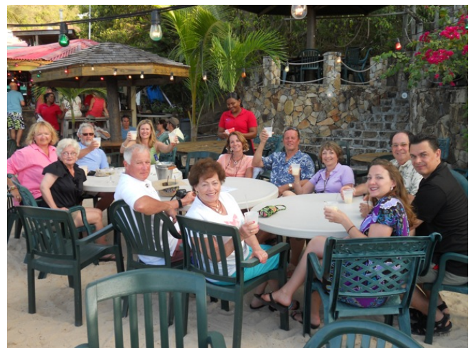
Happy Hour and Buffet at Leverick Bay (Hmmm.... do I detect a happy hour theme?)