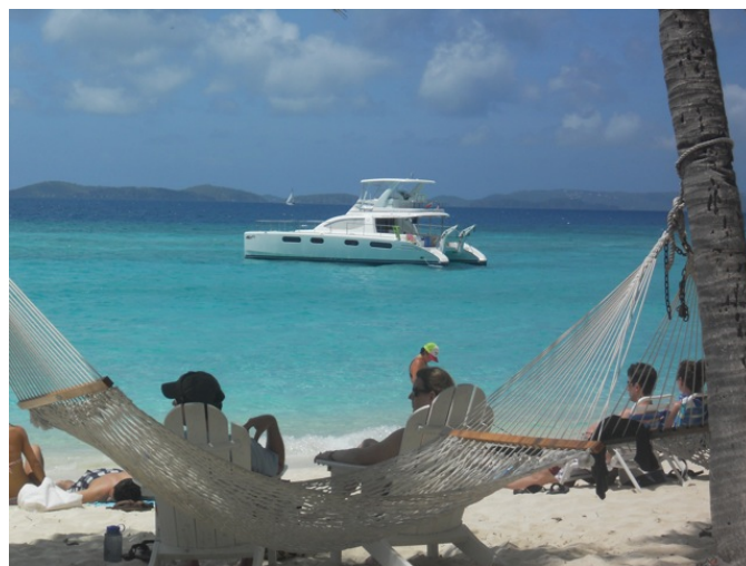
Looking out from Soggy Dollar Bar at one of our Boats

The boats were 47' power catamarans from The Moorings in Road Town, Tortola. With a 25' beam, these cats offered four generous staterooms with private head and shower, as well as a salon and galley, ample cockpit entertaining space, and plenty of seating for all on the flybridge. There were places to go for solitude, or space to hang out with the whole gang.