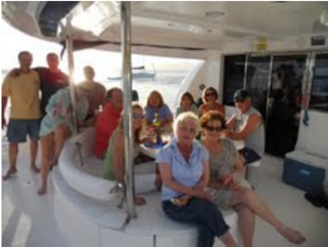
Happy Hour on the Cat

they considered just how many cases of wine and beer would be necessary for 10 days on the water: they returned from the market with 6 cases of wine, 2 cases of beer, 3 cases of diet coke (and how much rum?). The only reason they had wine left at the end of the trip was their discovery of a preference for the classic island drink – the Pain Killer. ‘No Pain’ became their motto. (We’re not saying which boat that was, but as you read on, remember this clue: an important ingredient of the Pain Killer is freshly grated nutmeg.)