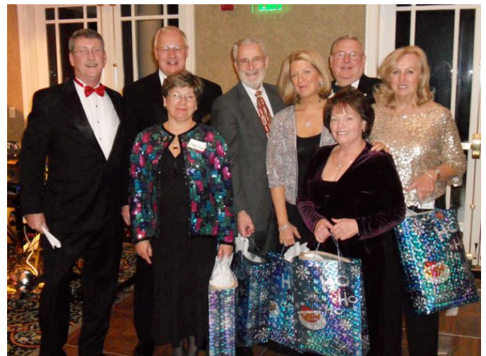
Thanks to the 2011 Board and Staff!