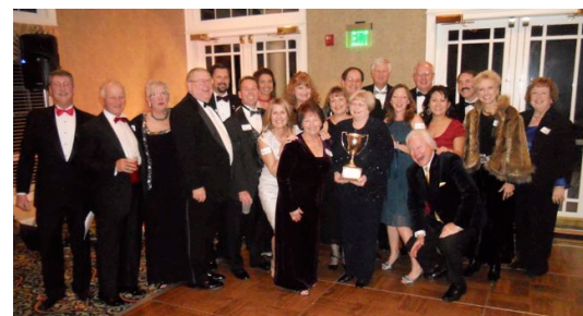
Participants in the PRYCA Float-In celebrating their victory with the "Cup"