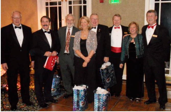
Your new 2012 Board and Staff

Our outgoing Commodore gave a special word of thanks to the enthusiastic party committee for a job well done.