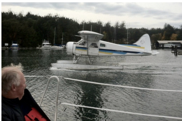
Captain Carl (Vancouver Sailing Club) gets the VIN # off a departing Sea Plane

The Pacific Northwest is beautifully dominated by granite rocks, cliffs and hills with giant evergreen trees. Everything is just a little bigger in size and scope than it ought to be, including the fast moving ferries, cargo ships and sea planes. You always had to have an ear out for the hum of a sea plane engine as they are a main source of transport between the islands and the mainland; and while they are the lowest on the “right of way” pecking order, they didn’t seem to give it much thought as they would swoop down and land or rev up and be gone within seconds.