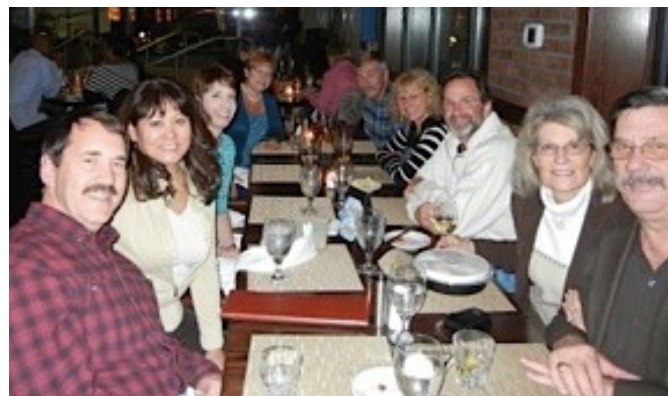
Dinner at The Public House