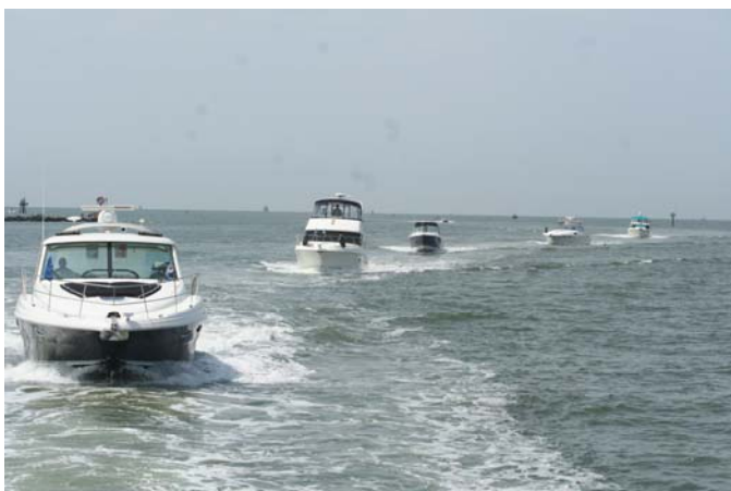
OYC Dismal Swamp cruisers follow Bay Dreamer as they head into the channel for Bay Creek Marina at Cape Charles: SEA DUCK TOO; Takin' It Easy; 'bout Time; Party Time; Deja Vu