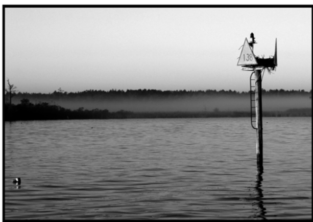
Morning fog leaving Coinjock

As it turned out we couldn't have done better and we arrived in Coinjock at about 1630. Little did we know but the weather that held us up on Friday and Saturday had a penned-up effect with all the boats heading south and we could only get one slip for three boats at Coinjock for the night. Miller Time had to raft up to Copy Cat , and Impulse rafted up to a 70' Sportfish. Once we were fueled up and secure for the evening we made reservations in the restaurant for Coinjock's famous 16-oz. prime rib dinner. The prime rib didn't disappoint. We even had leftovers for sandwiches the following day.