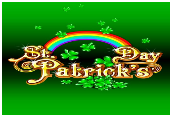
Everyone's a little Irish on St. Patrick's Day!