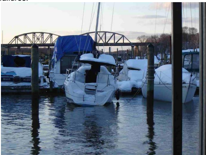
Somebody help me! I'm listing to starboard!

We have gone down and shovelled snow off of the bow and out of the cockpit 3 times so far. Many of the local marinas have called and sent emails to the owners to come down and check on their boats. It is not their responsibility to clear your vessel for you! The Occoquan marinas have done a wonderful job of removing snow from the docks to allow owners to access their boats. Even if you are in dry-dock or shrink wrapped, you still need to go take a peek. The snow has been so heavy, that there have been shrink wrap failures.