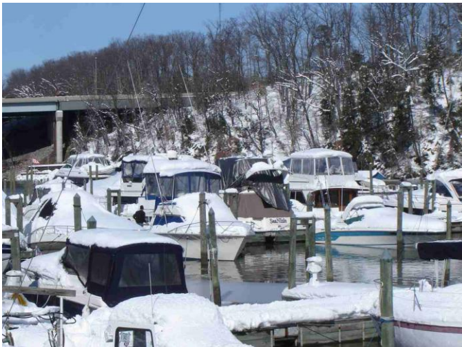
Snow...snow...everywhere on the boats

What has AMAZED me, though, is the absence of owners checking on their boats or removing any of the accumulated snow. Did you know a cubic foot of snow can weigh from 7 lbs to almost 20 pounds! For example, our cockpit is 10X10, with 24 inches of snow, the aft of the boat had 200 cubic feet of snow in it, with a rough average of 12 lbs per cubic yard, which is an additional 2,400 pounds. That means the average 30 foot boat could have an additional 4,800 lbs on board or even more!!