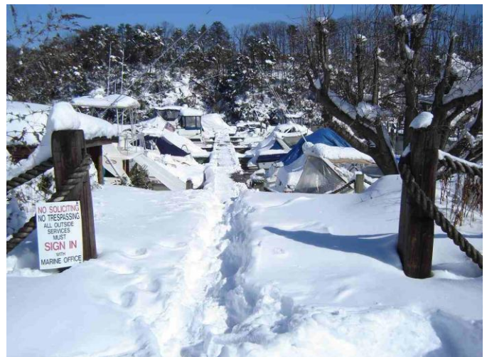
FYC shortly after the last snowfall in February 2010

The DC Area has seen a record snow fall of 55 inches this winter season so far. The spring boating season can't come soon enough!! BUT, that is only if you still have a boat to use.