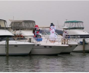
Ready for fun on the Dock

plenty of wine and hot toddies for an army. After everyone was fed and properly 'warmed up' from the hot toddies, we ventured out on the bridge to untie and get in line as a participant. We hovered out on the Potomac to await the arrival of the DC parade boats, and we fell in line toward the end. There were about 52 participants in all.