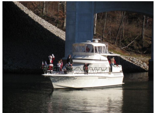
Santa waves as he enters the Occoquan town dock