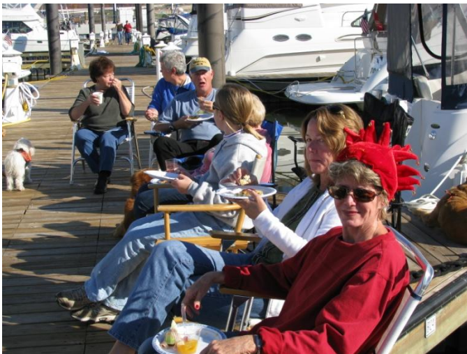
Another party on the dock...

the dock and dinner out (at various places) a number returned to continue to socialize. A number of people came down with the dreaded "Harris flu" the next day and were slow to mobilize for the day. After extensive consultation and dock walking, it was decided that we would postpone the planned dock breakfast until Sunday due to the threatening weather. Bloody Marys and other libations magically appeared and the plan of the day was executed.