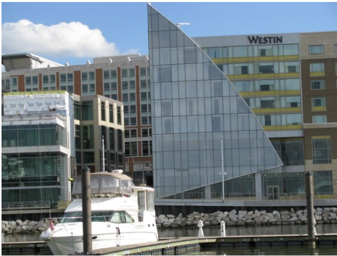
The beautiful National Harbor

the dock and dinner out (at various places) a number returned to continue to socialize. A number of people came down with the dreaded "Harris flu" the next day and were slow to mobilize for the day. After extensive consultation and dock walking, it was decided that we would postpone the planned dock breakfast until Sunday due to the threatening weather. Bloody Marys and other libations magically appeared and the plan of the day was executed.