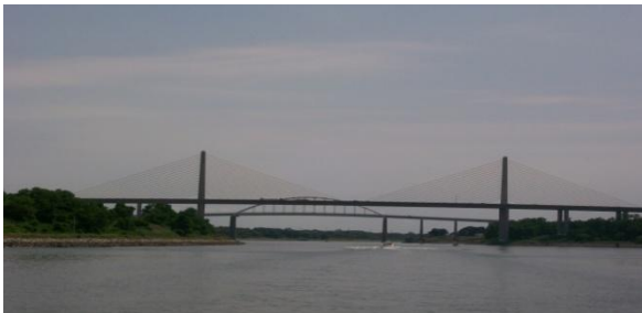
The C&D Canal

After leaving Kent Narrows behind us, we went through the Chesapeake and Delaware Canal, where we stopped for the night at the Chesapeake Inn & Marina. The C&D Canal is 14 miles long, 450 feet wide, and at least 35 feet deep all the way across. The last part helps a lot when a huge containership is coming your way straight down the middle of the canal (okay that didn't happen this time, but it did the last time we went through).