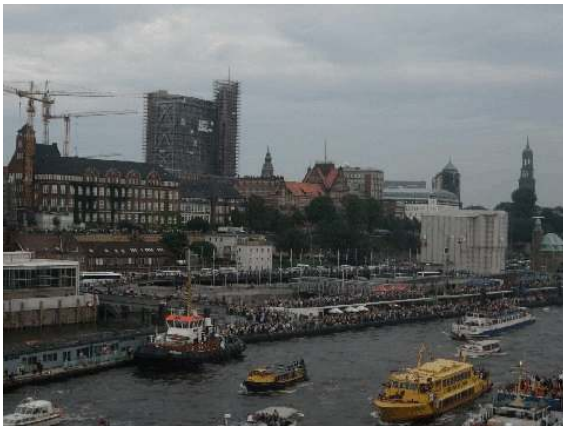
A Fraction of the Crowd, Ashore and Afloat, Wishing Us Bon Voyage.

Everyone has to have their share of hardship. Jet lag is not fun! We tried to make up for it by our day trips in Germany, starting from Traben Trarbach, a pair of beautiful, small towns built a long time ago on opposite shores of the Mosel River. Famous for wine and ambience the region is perfect for a day on a river