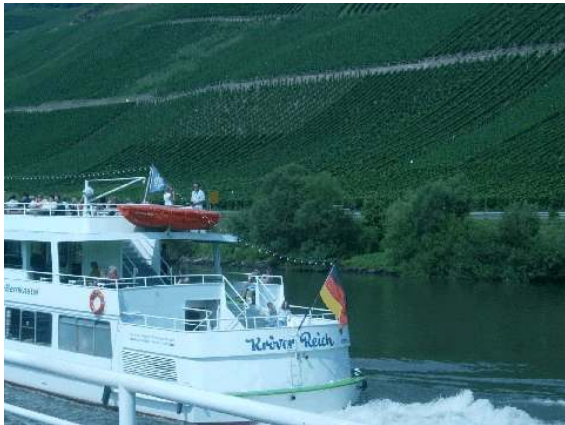
Cruising the Mosel, Note the Vineyards.

O.K. you know we would not be here to write this article if the captain and crew drove Bat Too into gale force winds and two story waves in the North Atlantic. However, provided some good advice from yacht club friends, we were safely onboard the QM2, cruising at 24.5 knots on a transatlantic journey from Hamburg, Germany via South Hampton, England to New York, and hardly felt any movement.