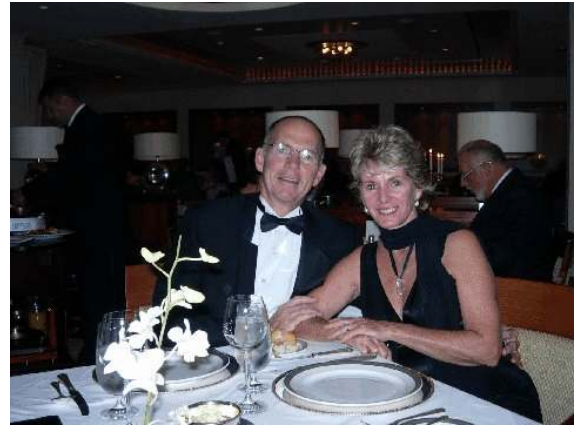
The Author and her Captain.

I'm not here to be an advertisement for Cunard but the ship, service, amenities and, of course, the food and wine were outstanding. The weather on the other hand could have been better. A low pressure