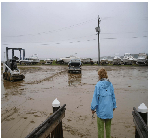
No. It's not New Orleans after Katrina ... it's Colonial Beach after Ernesto.

Our Fall membership meeting will be held at Fairfax Yacht Club on Saturday, October 21, from 2-5 pm. Remember, this is also our Chili and Dessert Cook-Off. We will be awarding 1 st , 2 nd , and 3 rd prizes in each category and the judges will be all of you.