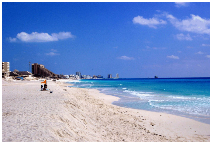
An artists conception of what Occoquan Bay looks like in a boater's mind. Yeah – Keep Dreamin.