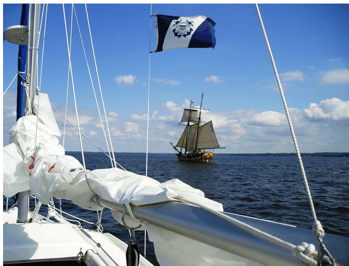
An Award Winning Photo.