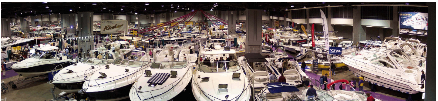
For those of you who missed the boat show, here's a glimpse.

Pt. Lookout Marina; Solomon's Island; St. Michaels; Cambridge; and back into the Potomac at White's Point on July 1 st . The last stop will allow those who want to hook up with the Fourth of July trip to stay at White's Point or to go up river to hook-up with the Washington Basin bunch. So far nine boats have indicated interest. If you are interested and haven't already signed up at the Plan Fest, drop me an e-mail at hpcroft@verizon.net . More details and a confirmation request forthcoming as we get closer to cruise time.