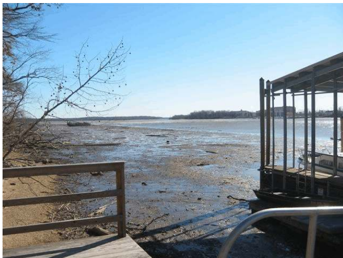
This is what it looks like when the wind blows the water out of the Occoquan. Picture taken from Fairfax Yacht Club.