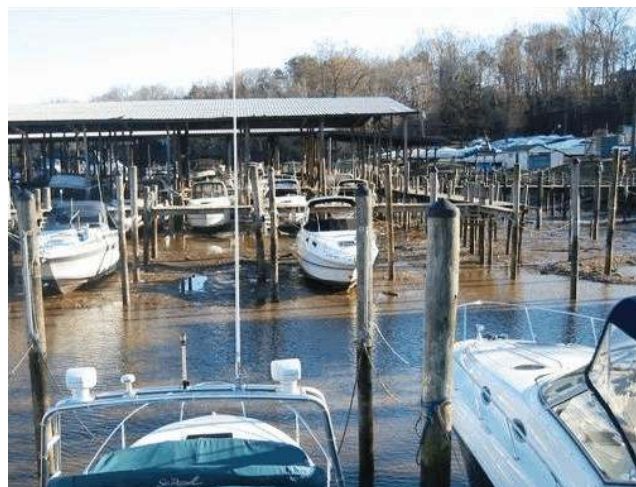
One last photo of Hoffmaster's Marina.