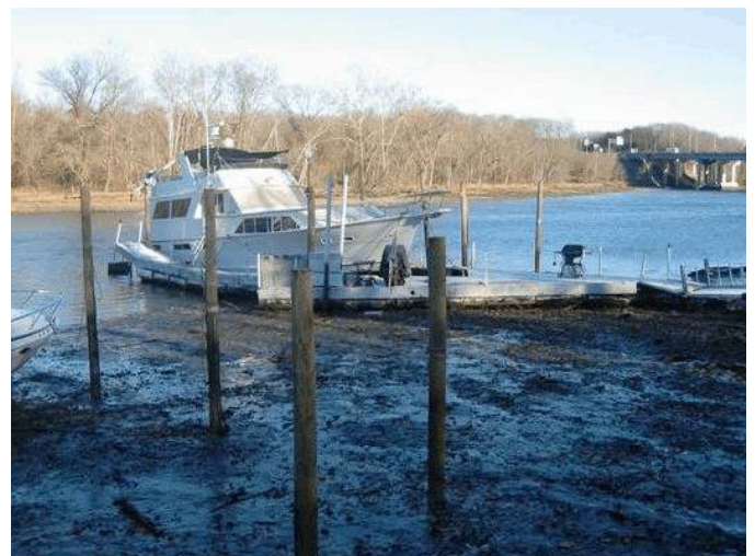
High and Almost Dry at Hoffmaster's.