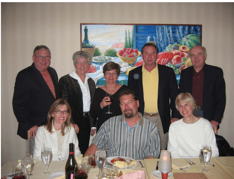
Boaters can have fun, even in the middle of winter.

It was unanimous that Cambridge provided the OYC Land Cruisers with all that was needed – mixers, spirits, and the water view of the Choptank River!!!!