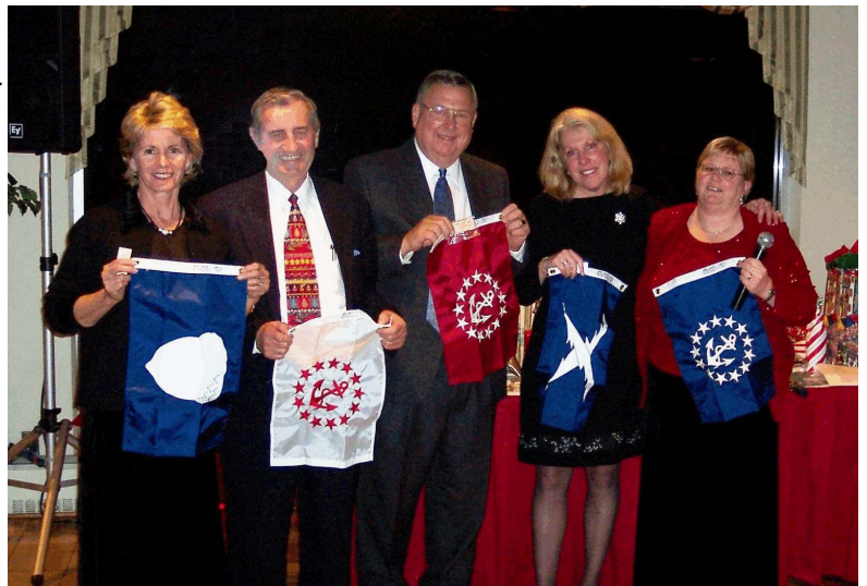
The 2006 Occoquan Yacht Club's Board