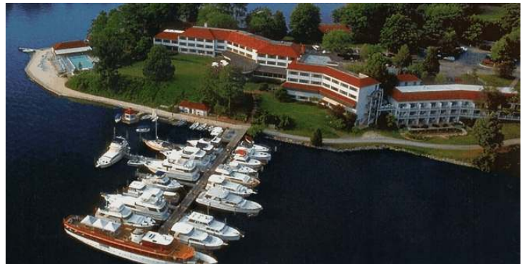
Aerial view of The Tides Inn with the Miss Ann at bottom.

The event will be the weekend of 17-19 February (arrive Friday & depart Sunday). The Inn is located in Irvington, Virginia about 2.5 hours drive South along the Rappahannock River. Room rates will begin at $159.00 per night for deluxe accommodations. Pets are welcome w/a one time "pet fee" of $35. We will be able to negotiate a lower room rate with 10 or more Club members attending. Weekend schedule will develop as we determine interest and attendance.