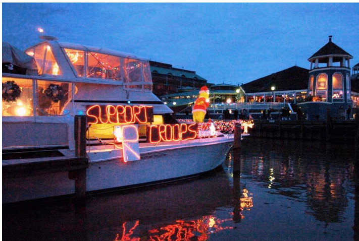
Plane to Sea II

Saturday, Dec 03, there was a dismal weather forecast, but having some experience with weather forecasters and the fact that I was the coordinator, we