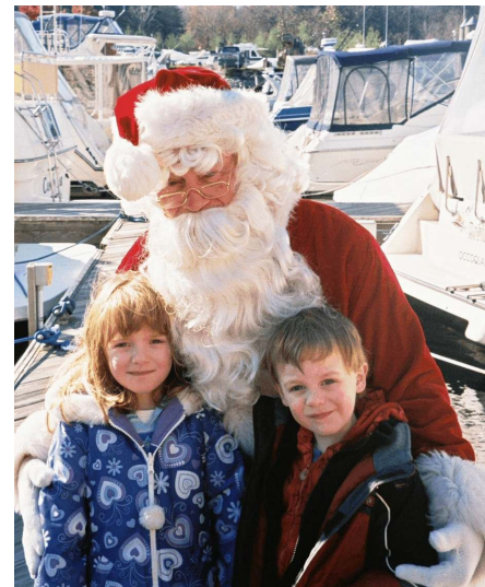
They're Smiling – Santa must have told them that they've been good this year.