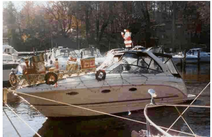
Santa's Nautical Sleigh has Arrived.