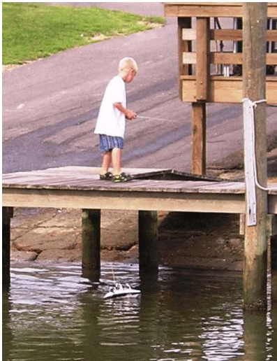
A future Captain practicing.

Forever Dreamin’ had a new first mate for the Cole’s Point cruise. My adventure began when mom and hubby couldn’t make the trip. Hooray, I was going on a trip with just my dad and my favorite puppy. Then the weekend before the cruise my training started. I was really nervous. Mom started to teach me how to handle the lines and what lines are used for what and all that good stuff. Then right after that the captain (a.k.a. dad) taught me another way or “the right way” to handle the lines. What difference does it make anyway; the captain is just going to “fix” it his way? Then if that wasn’t stressful enough he gave me a test on tying up the boat.