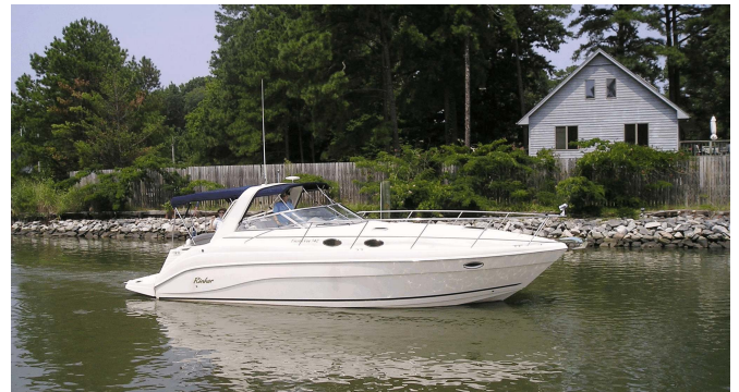
A new OYC member – Rags to Riches