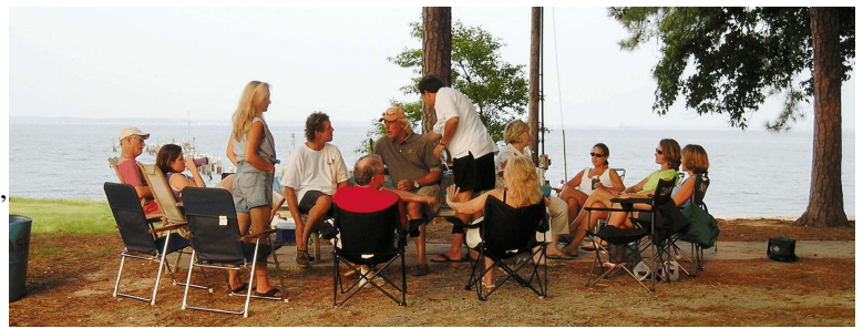
Some of the crew enjoying the evening.

Now it’s time to make breakfast; I could not find a