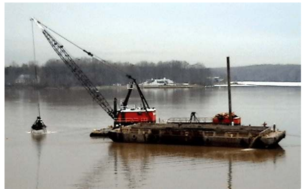
Can there be a more beautiful site – to a boater, that is?