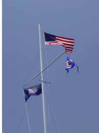
Long may they wave...