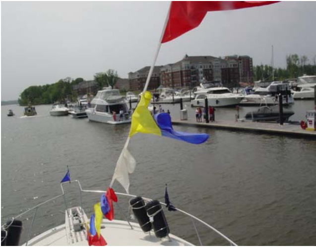
Approach to Sea Duck Too, the "Blessing Boat"