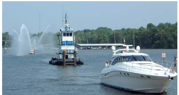
VIP boat leads the way for the Blessing of the Fleet. Between four and five hundred boats took part (actual number 178).