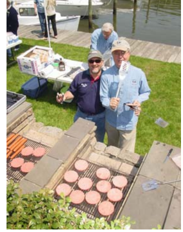
Rhodes and Cheatham flogged the burgers and weiners.