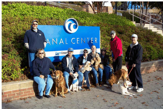
The Anal Center? Whatever – Everyone Had a Great Time.