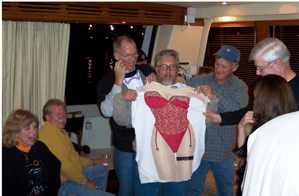
Occoquan Yacht Club Members Occasionally Like to Have a Little Fun. This one shows award potential at the annual photo contest. The Editor thinks it would be better without the beard.