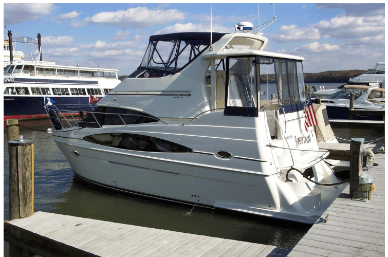
A familiar sight that you won't be seeing next year.