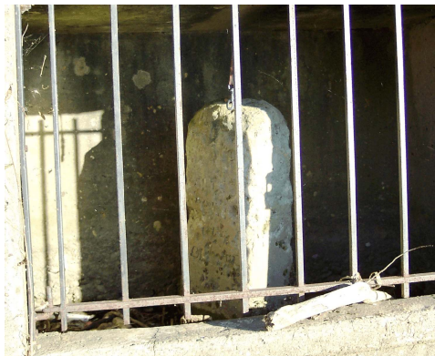
Boundary Marker One

Multiple dogs showed up for the 7:30 dog walk on Saturday. We made our annual trek to Jones Point and observed the Wilson Bridge construction along the way. We then all looked at the first boundary stone laid down to mark the District of Columbia. It is almost at the water's edge, behind a little fence, under the old lighthouse and you have to know where it is to