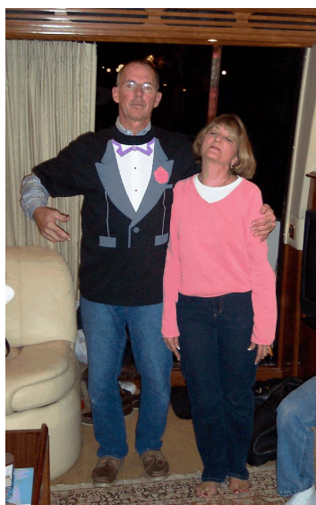
All Dressed Up.