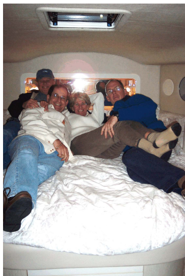
A New Boat With Room to Spare