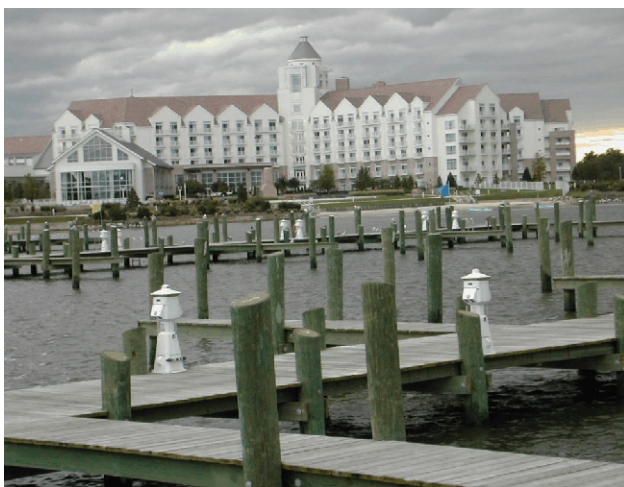
The Recent Cambridge Stealth Boater Cruise.

We are welcome to all suggestions and especially need more of you to help out. As you begin recalling your fun days with OYC during 2004, and begin to anticipate next year, please also think about becoming an OYC volunteer.