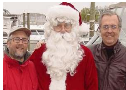
There must have been a high threshold on what Santa considered bad last year.

But, that won't stop the OYC from having our party. See you there between for an hour or so of revelry starting at the normal 11 AM.