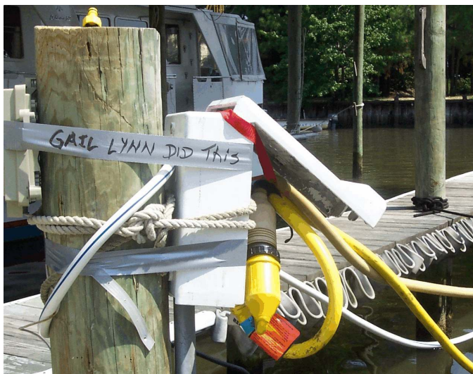
The Sea Gremlins worked long and hard over the Labor Day Weekend to get this one just right.