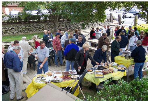
Great food, great friends, and great weather.

Please stay tuned for future events, either through the Daymarker, e-mail, or our website.