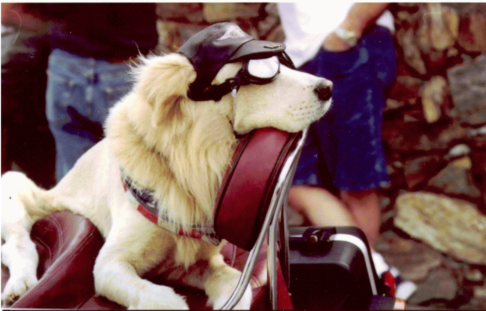
Second Place - Wild Life —"Walk on the Wild Side" by Rob Grant