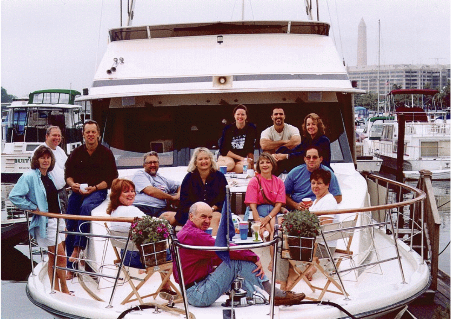
First Place - People —"Columbus Day" by Tony Mirando