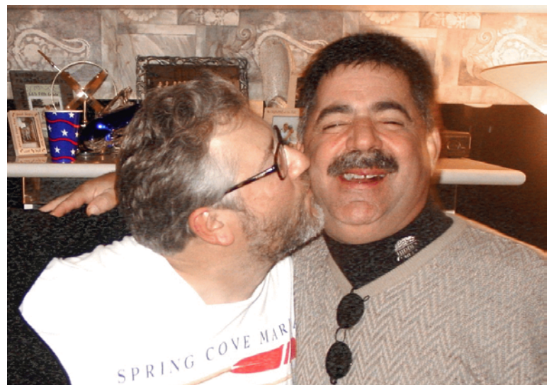
Third Place - People —"Kissing Wexler"