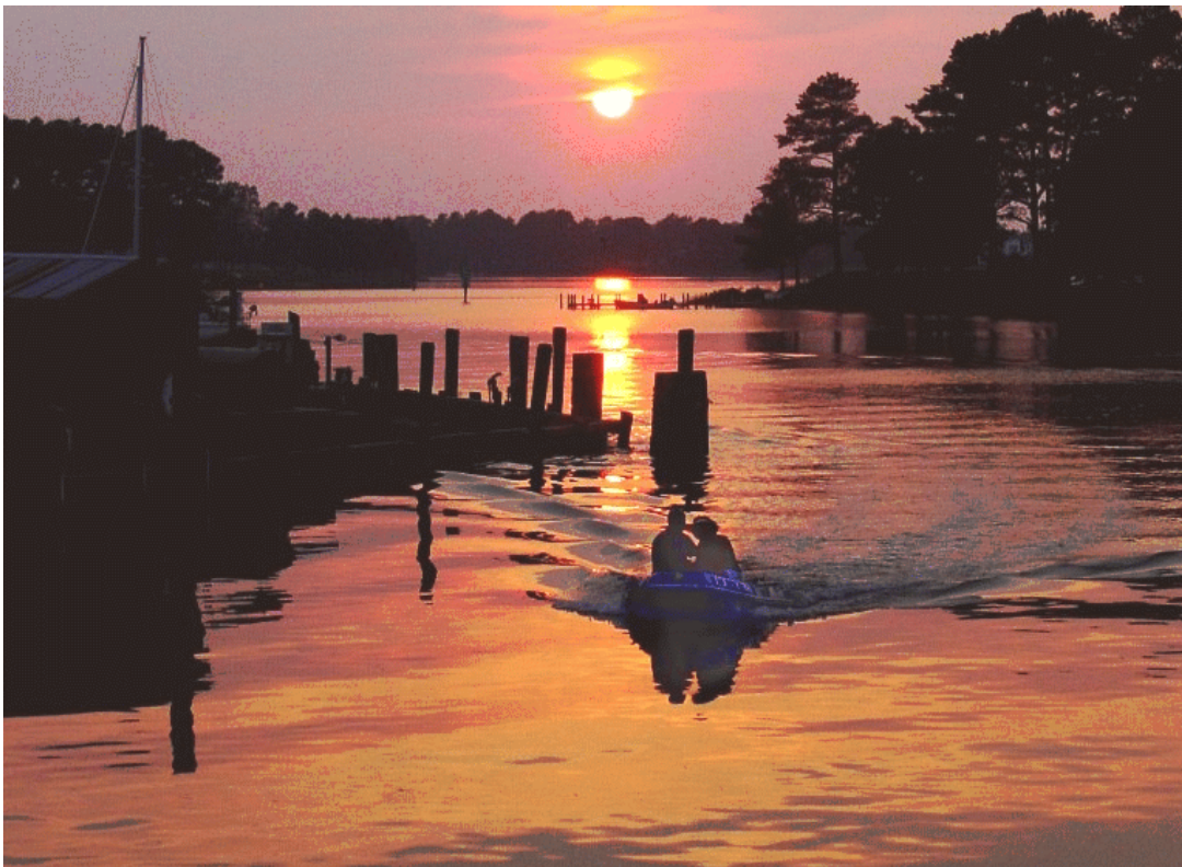
First Place - Landscape —"Onancock Dinghy Ride" by Tom Coldwell