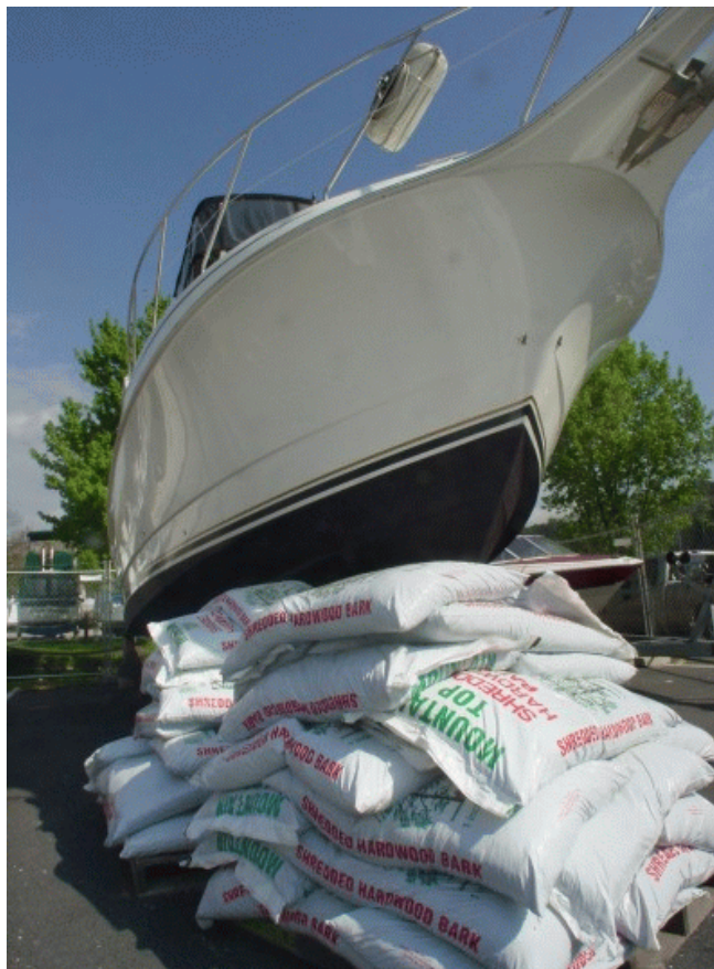
It's Springtime —Time to mulch your boat.

Some winning shots appear on the next pages. Warn your kids.