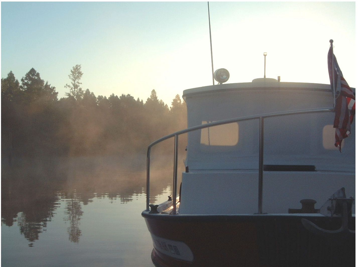
Third Place - Landscape —"Artsy" by Ned Rhodes

See these photos in their glorious full color when this issue of the Daymarker is posted on OYC's website, www.occoquanyachtclub.org .