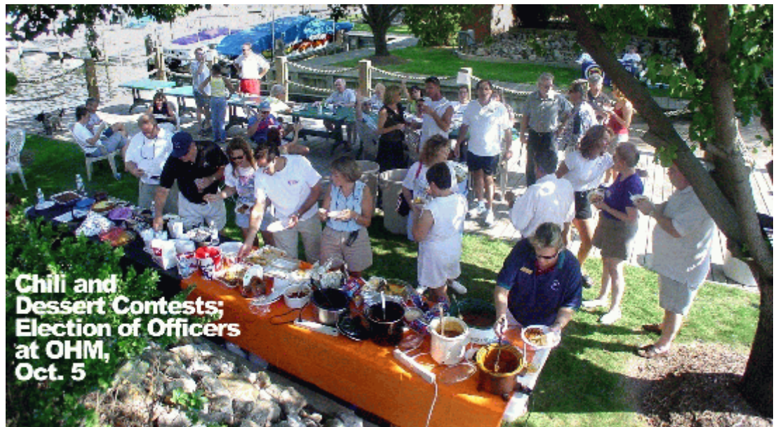
Chili and Dessert Contests; Election of Officers at OHM, Oct. 5