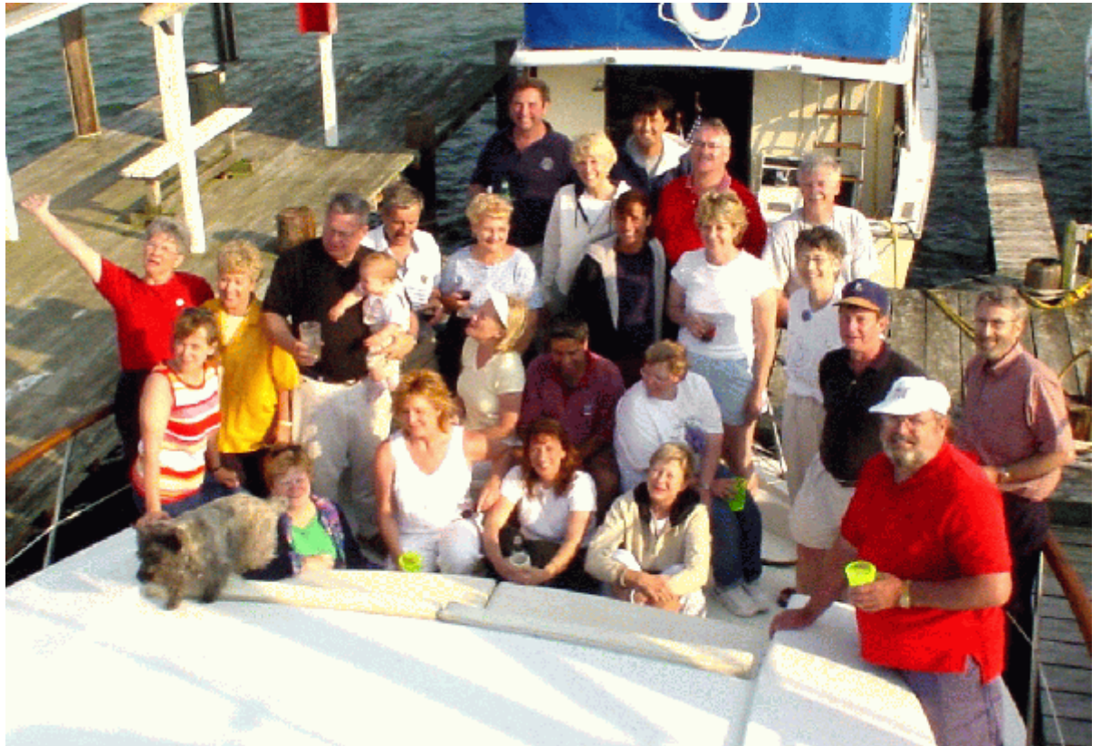
OYC at Tall Timbers —This hearty crew gathered for a (formal?) portrait during the Memorial Day weekend at Tall Timbers Marina, 60 miles down the Potomac. Left to right, no...first row.. uh, seated are... ah, forget it.

On Saturday, a radio watch was posted for Oasis 2 , Vaya Con Dios and Touch of Fate arrivals and Sanctuary docked with fanfare just in time to host a grand happy hour social to highlight the evening.