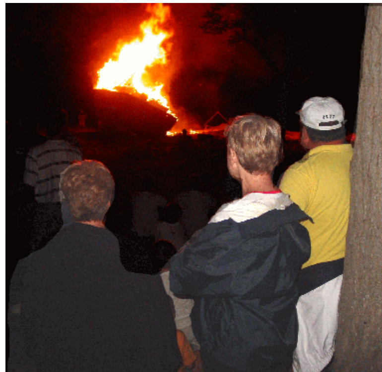
Just for fun, Tall Timbers set this bonfire in the hulk of an old boat.