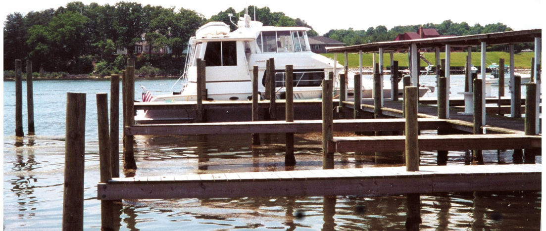
Flagrantly doctored photo purportedly showing Sea Duck Too at Olverson's. Unretouched photo is shown below.