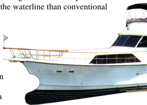
Ax Bow design as it might appear on this unidentified OYC vessel.

Most of us wouldn’t care about this, but if you happen to see a certain OYC yacht plowing into a water level pier to create this dent, which is then