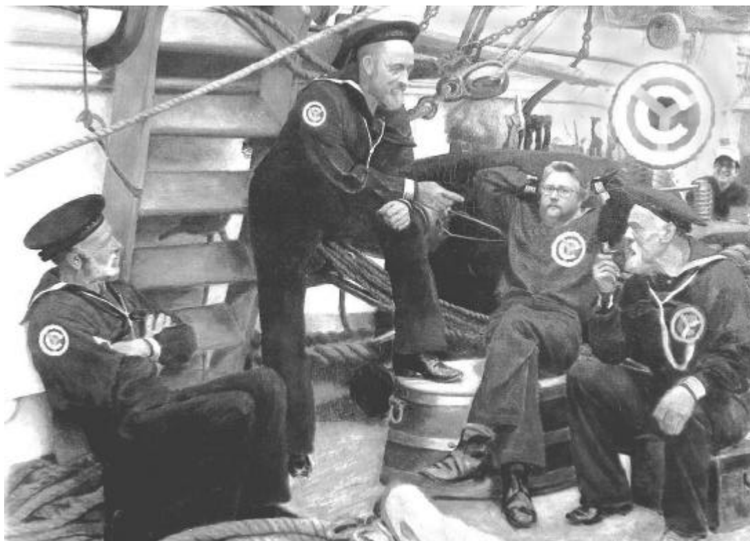
OYC's First Planfest —A search of The Daymarker's archives yielded this photograph of some old salts gathered to plan their cruising for the next boating season. The 2001 Planfest is set for 2:00 p.m., January 21 at Gecko's Restaurant.